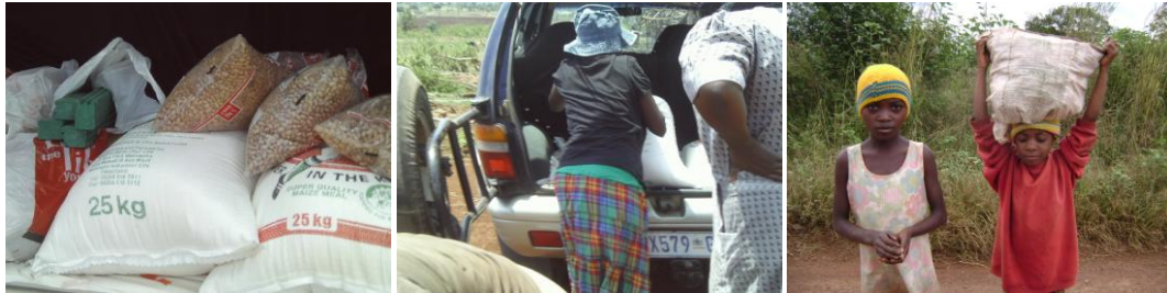
We delivered aprox of 5 tons of food for the orphans

In 2012, as in previous years, we decided to pay for ploughing . Widows of the community had to plant the maize themselves, which should give them enough food to support their